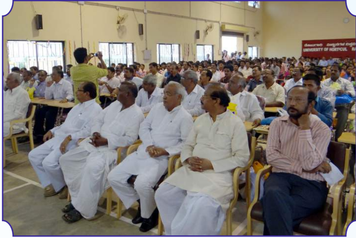
UHS, Main campus