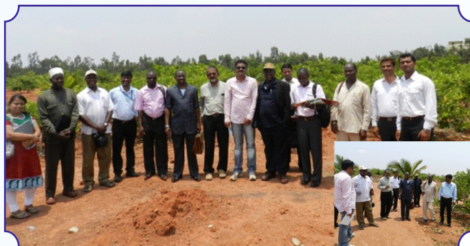
Tanzania Delegates visited to RHREC, Bangalore on 20 th May 2014 under Cashew Export Promotion programme.